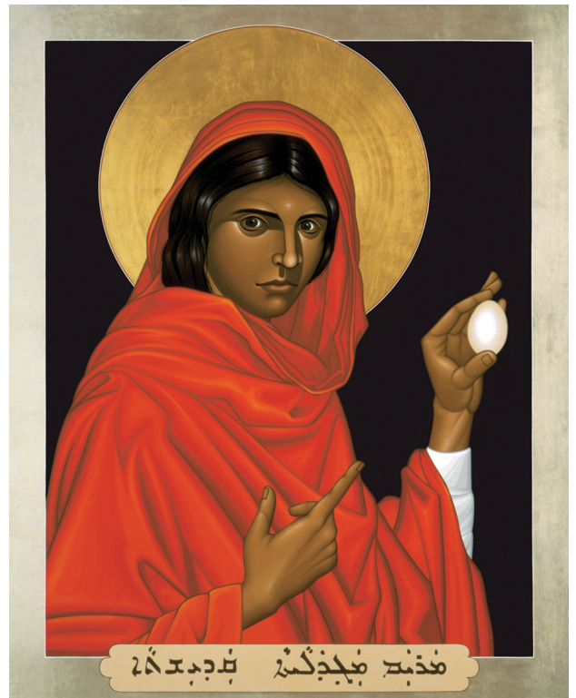
Marv of Magdala